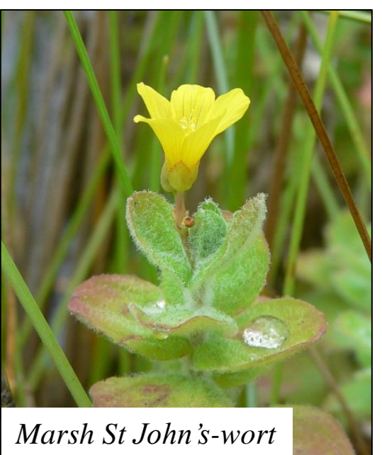
Marsh St John's-wort