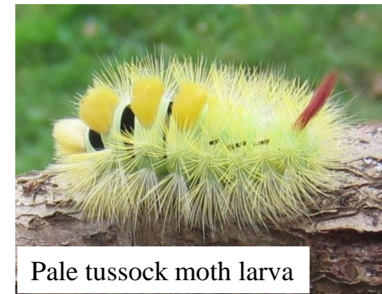
Pale tussock moth larva