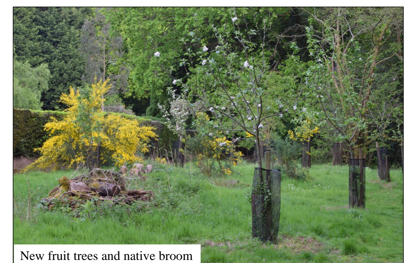
New fruit trees and native broom

More information: www.friendsofnormandywildlife.org.uk www.normandyparishcouncil.gov.uk ; includes Normandy Common Surrey Wildlife Trust Report 'Normandy Common Ecological Appraisal & Management Plan 2014-2018'