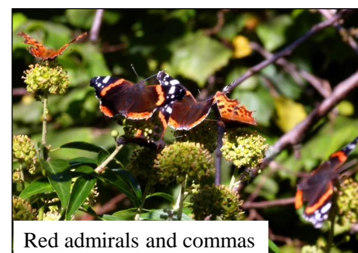
Red admirals and commas