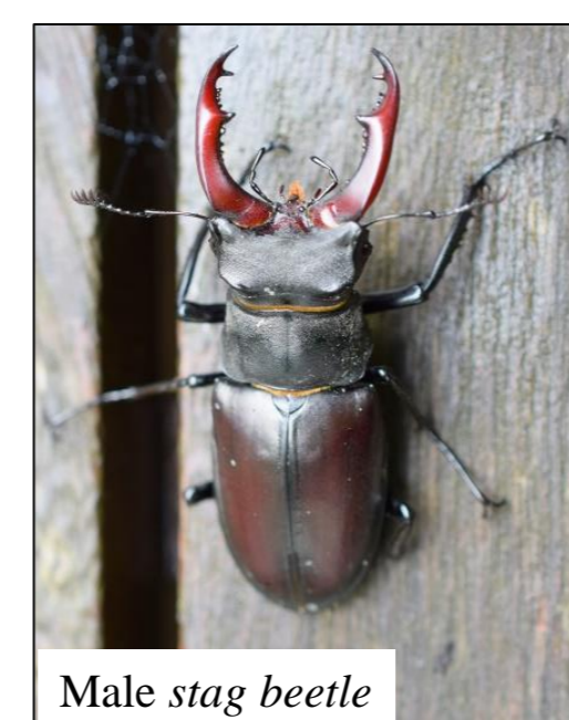
Male stag beetle